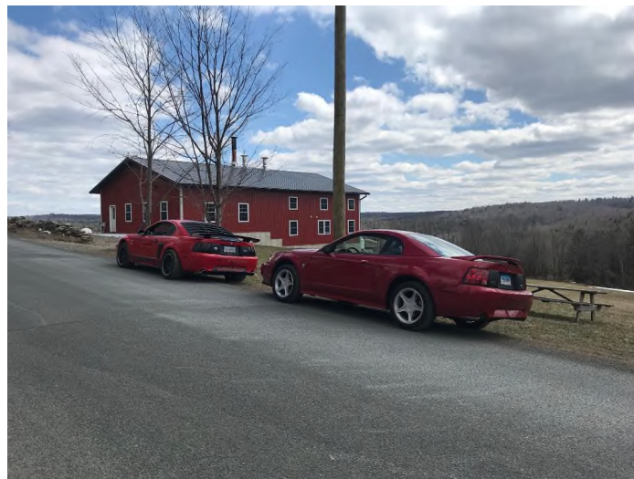
Both groups join up in Canton, some of the Model As that led the tour, and even some newer hot rods. The red building is the new syrup house. A pancake breakfast and a tour of the syrup house were enjoyed by all.